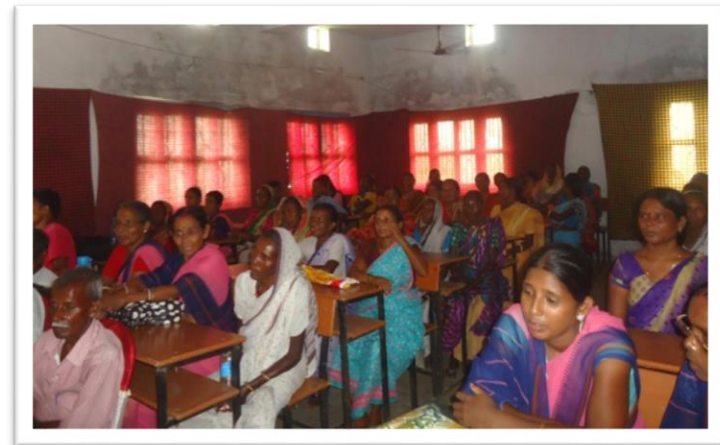
Dais and government health workers sit together during consultation