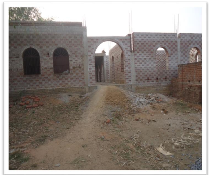
The entrance to the new building in Koromtandr

In Koromtandr the new building continues to grow, slowly and steadily. The entrance from the roadside has been constructed, joining together the health centre and office portions of the building. Thanks to friends from Cadmores End Church , the RCOG Indian Liaison Group , and other friends, the building continues to grow.